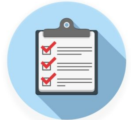
Home Health Survey