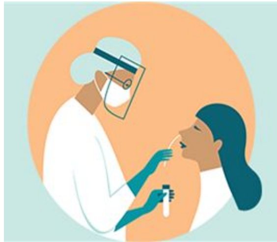
Frequent and ongoing testing for all students and staff