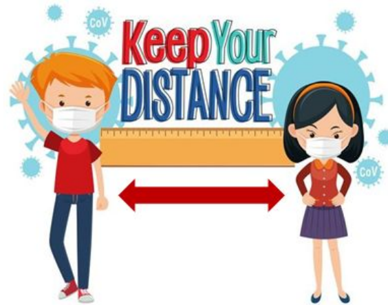
Social Distancing When at all Possible