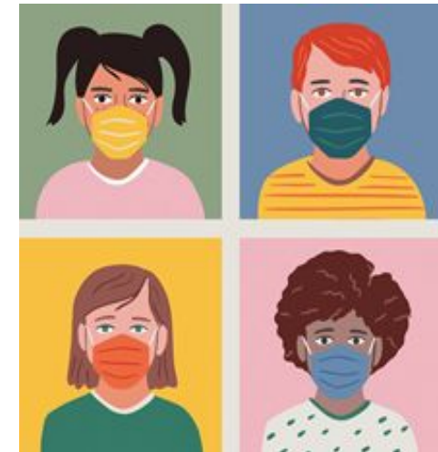
Indoor masking for EVERYONE