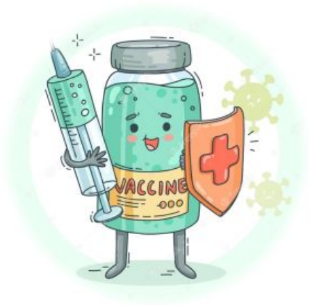
Vaccinations for Eligible Populations